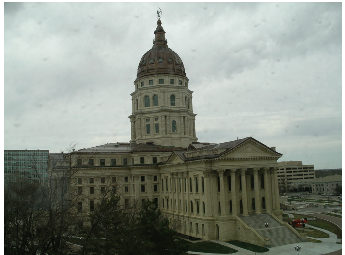
View of the new capitol dome from the office window.

Revisions to the Board's regulations will follow approval of the statutes.