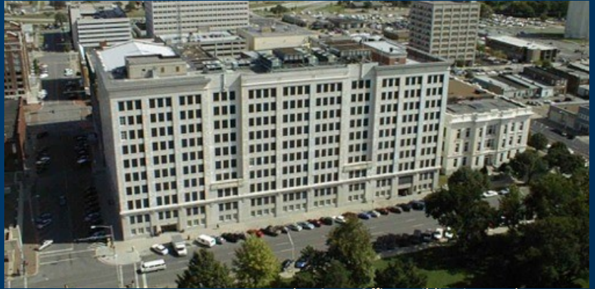
Landon State Office Building in Topeka, Kansas

The Kansas State Board of Technical Professions routinely releases current news on the homepage of their website . Archived news releases and newsletters may be located on the News Item page. This newsletter highlights news the Board has shared since December 2022 for your convenience!