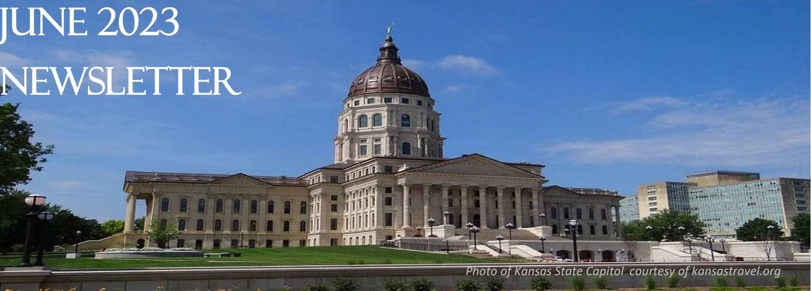
Photo of Kansas State Capitol