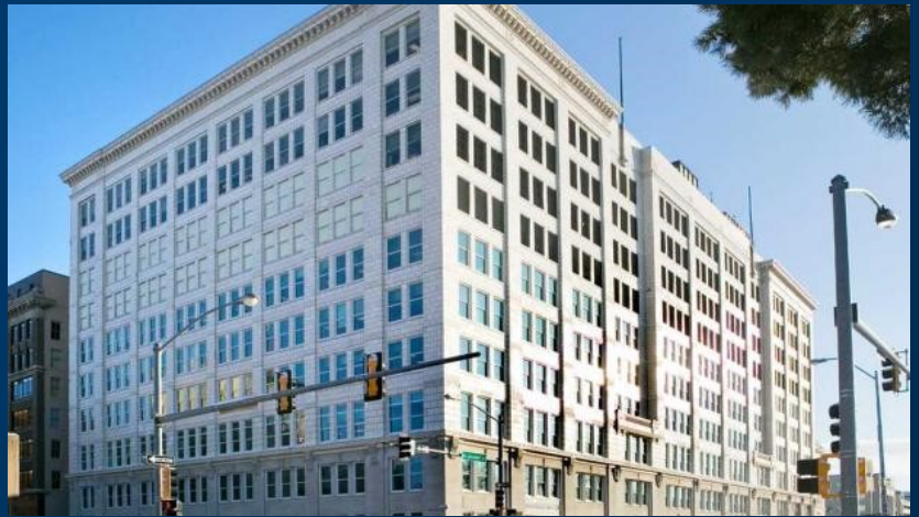
Landon State Office Building in Topeka, Kansas

All contact information for individuals and business entities may now be updated ONLINE through our website! Navigate to http://ksbtp.ks.gov then click on Forms > “Update Your Contact Information Online.” A staff member will reply with confirmation of your successful changes within 3 business days. All paper Change of Address Forms will still be accepted.