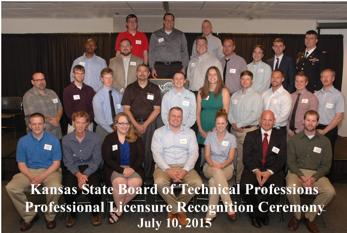
Kansas State Board of Technical Professions Professional Licensure Recognition Ceremony July 10, 2015