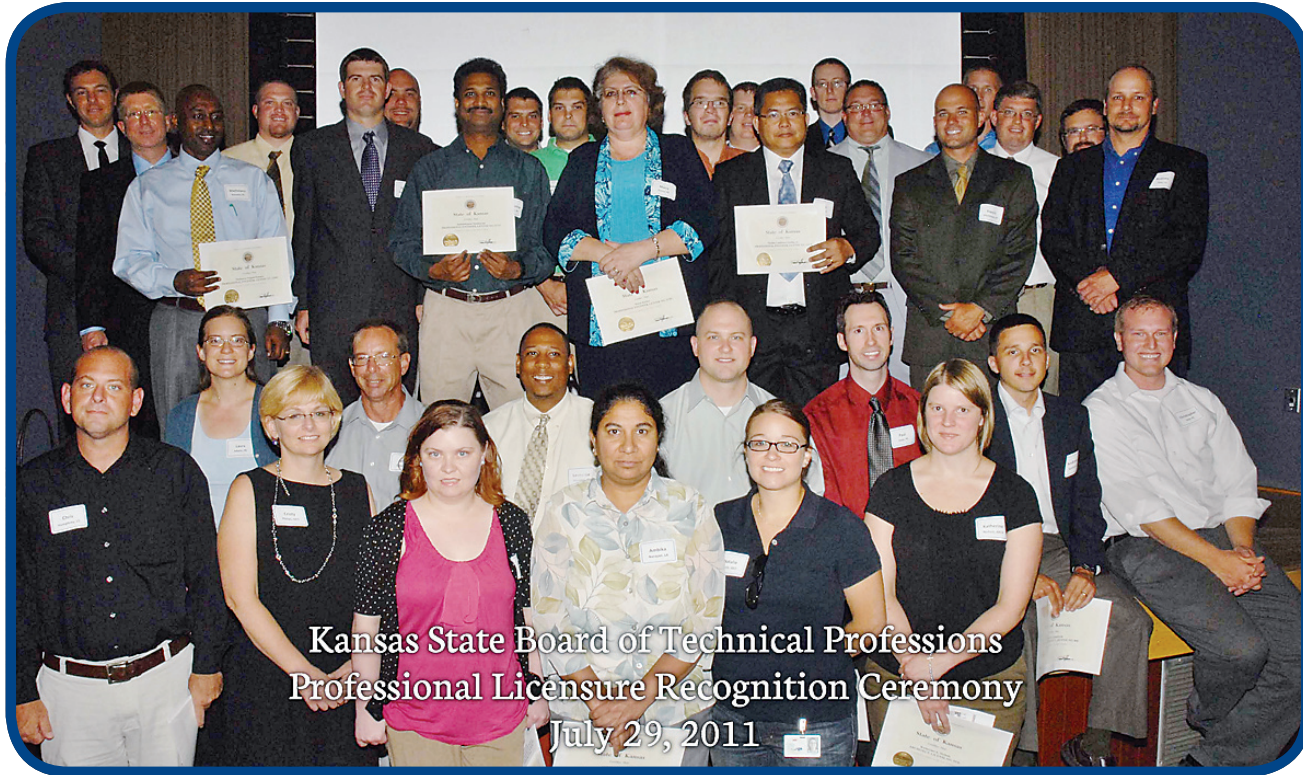
Newly Licensed Professionals