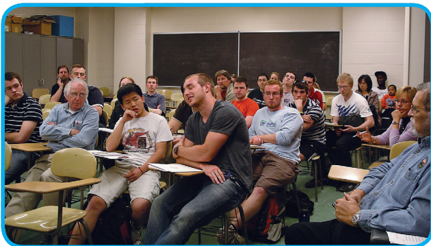
Many KU students attend forum with Board members

Six members of the Kansas Board of Technical Professions met with University of Kansas students on April 14, 2011, in Learned Hall on the KU campus. Approximately 35 students attended from the architecture, engineering and geology schools. Members of the Board spoke to the students regarding the importance of licensure for their professional careers, presented information on the various licensing exams, gave tips about the five professions licensed by the Board, and answered the students' questions.