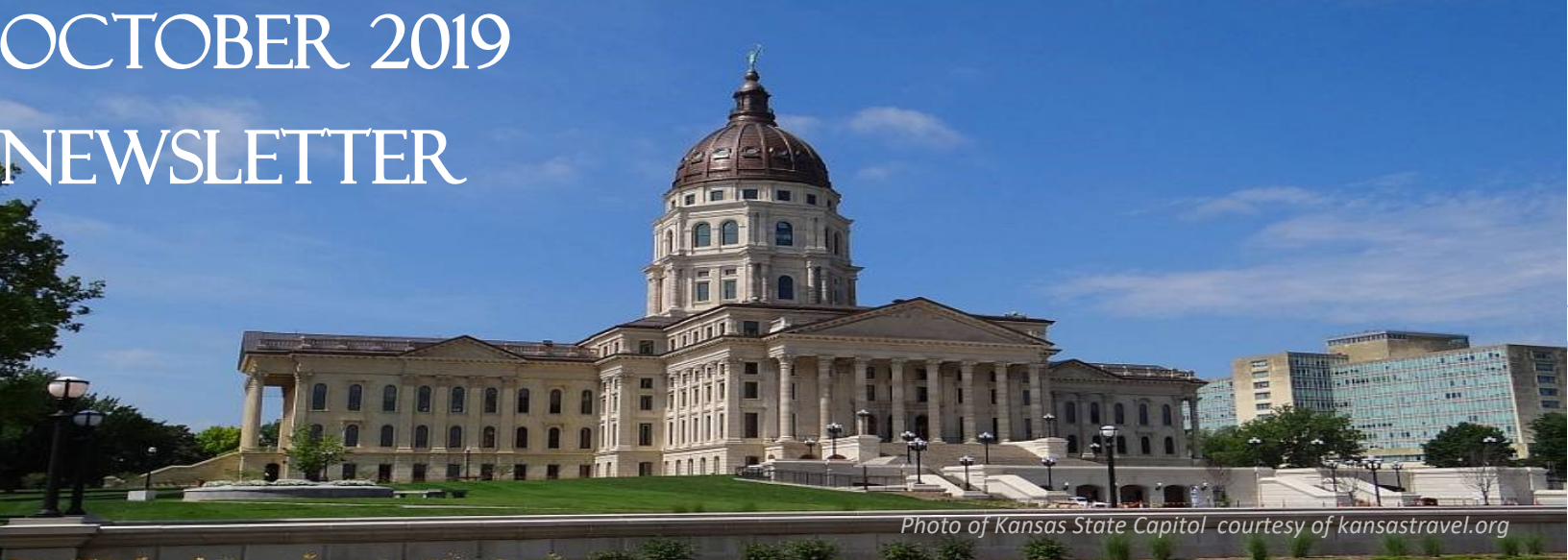
Photo of Kansas State Capitol