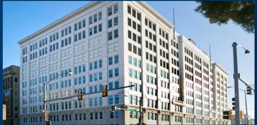
Landon State Office Building in Topeka, Kansas

https://governor.kansas.gov/serving-kansans/office-of-appointments/